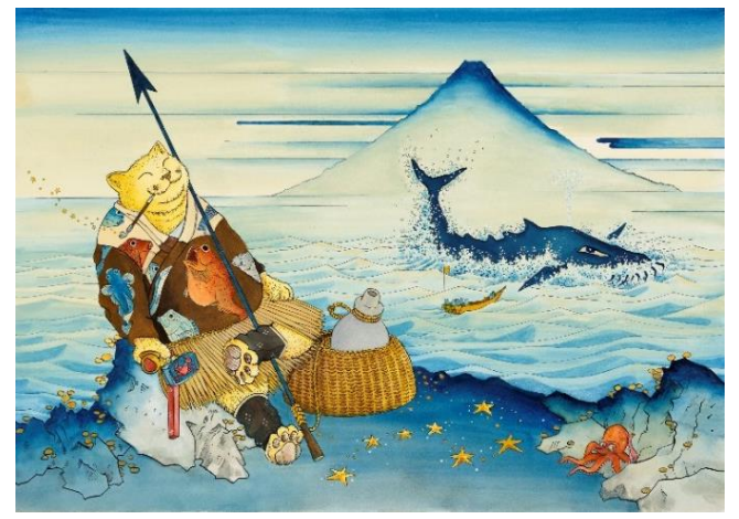
MASUMURA Hiroshi "Fisherman" 2018 © MASUMURA Hiroshi