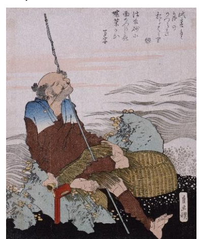
Katsushika HOKUSAI "Fisherman"

New work "Fisherman" from series "ATAGOAL X HOKUSAI" will present. This work is drawn newly for the exhibition.