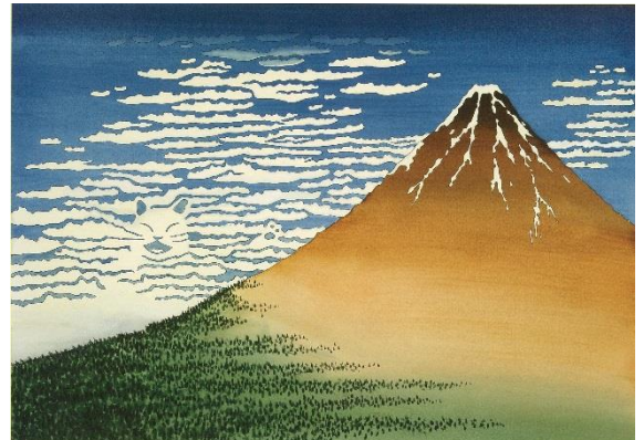
Katsushika HOKUSAI "A Mild Breeze On a Fine Day from series Thirty-six Views of Mount Fuji"