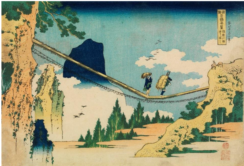
The Hanging-cloud Bridge at Mount Győdő near Ashikaga (Ashikaga Győdőzan Kurno no kakehashi), the series Remarkable Views of Bridge in Various Province"

◇Tue 11 September – Sun 4 November 2018 Hokusai Bridge in Sumida (tentative title)